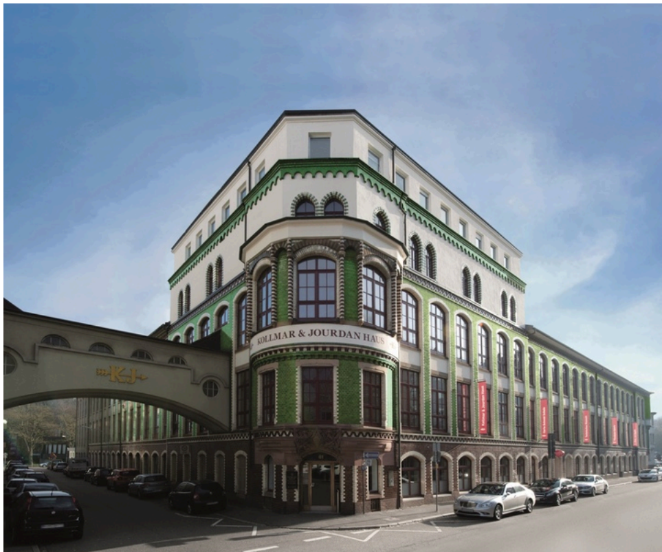
Technical Museum of Pforzheim's Jewellery and Watchmaking Industries | Technisches Museum der Pforzheimer Uhren- und Schmuckindustrie