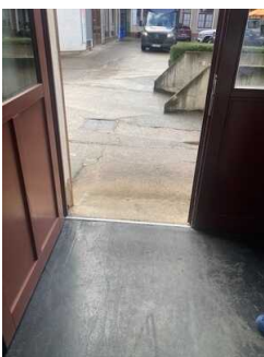
stepless side entrance