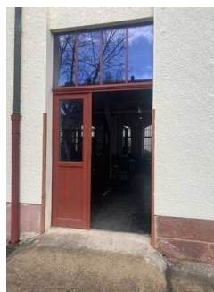
stepless side entrance